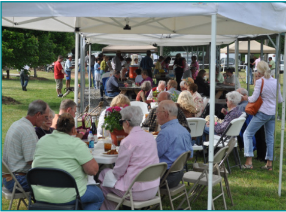
Everyone enjoying the 2012 Hunter Derby.

The St. Luke's Hospital Foundation is fortunate to have two successful, annual events that are fun for the whole family! The Blue Ridge Hunter Jumper Association (BRHJA) Hunter Derby and the Ache Around the Lake are well known events that bring out the crowds!