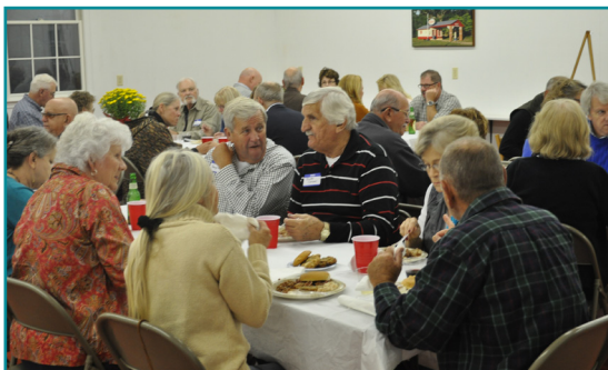
Guests enjoy a recent Building on Excellence event held at Mack Henson's Farm.