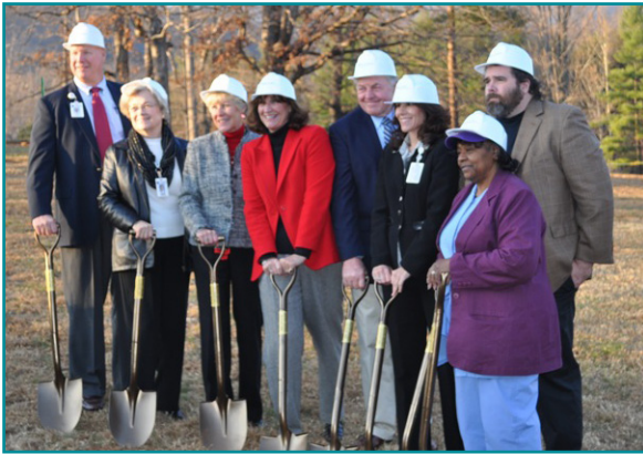
The Groundbreaking ceremony held in Nov. 2012 marked the beginning of construction!